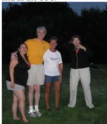
Above, left: Kappa Iota, as always, making a strong showing at the event.