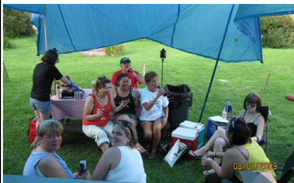
Left: Under the tarp...