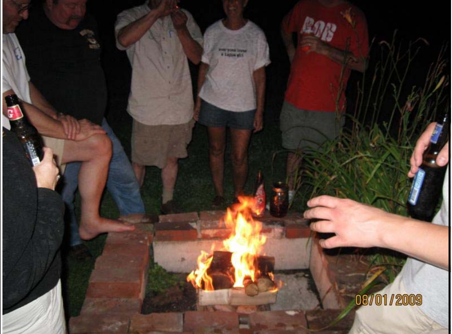
Before the explosion...