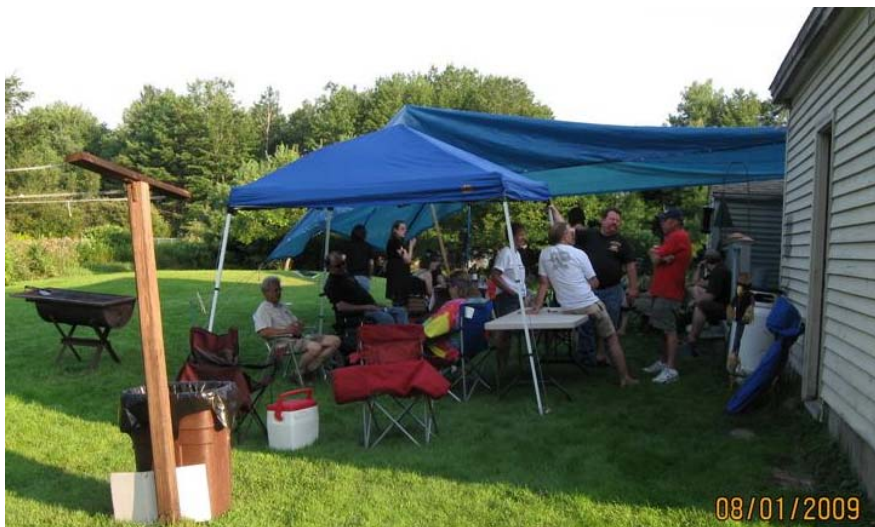
The blue tarp provided shade rather than shelter from the rain this year, with perfect weather – sunny and in the 80's!