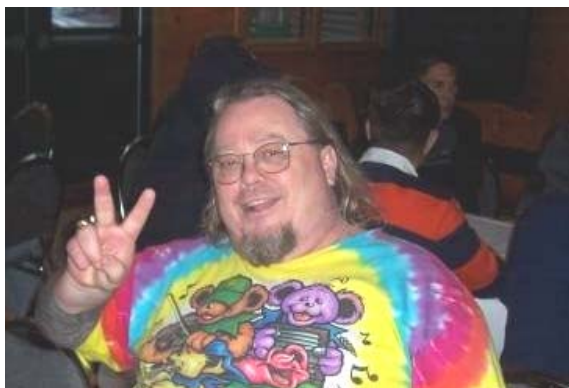
Below: The assembled Brotherhood attending the event.